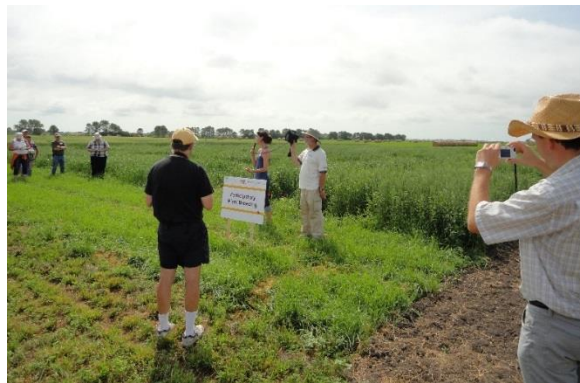
Participatory plant breeding field day

The organic producers have had a profound effect on the direction of research. We have, as a collective national group of organic agriculture researchers, surveyed them quite heavily to try to find out what are their limiting circumstances. That strategic approach has really paid off, and we continue to learn more about their problems. And, the industries are informing us about what are the new markets. Those are very, very important signals, because farming is